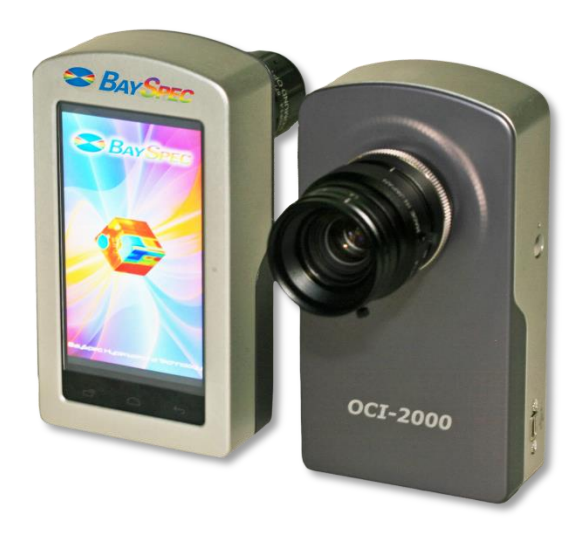
OCI-2000™ Handheld Snapshot Imager